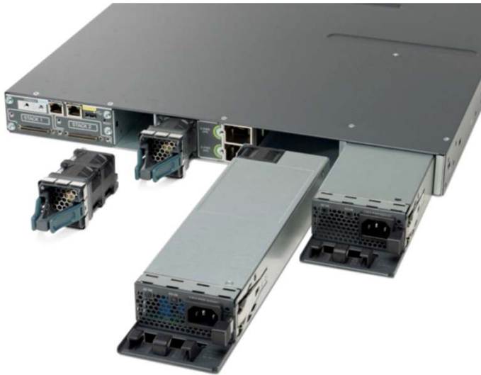
Figure 5. Dual Redundant Power Supplies

Table 6 shows the different power supplies available in these switches and available PoE power.